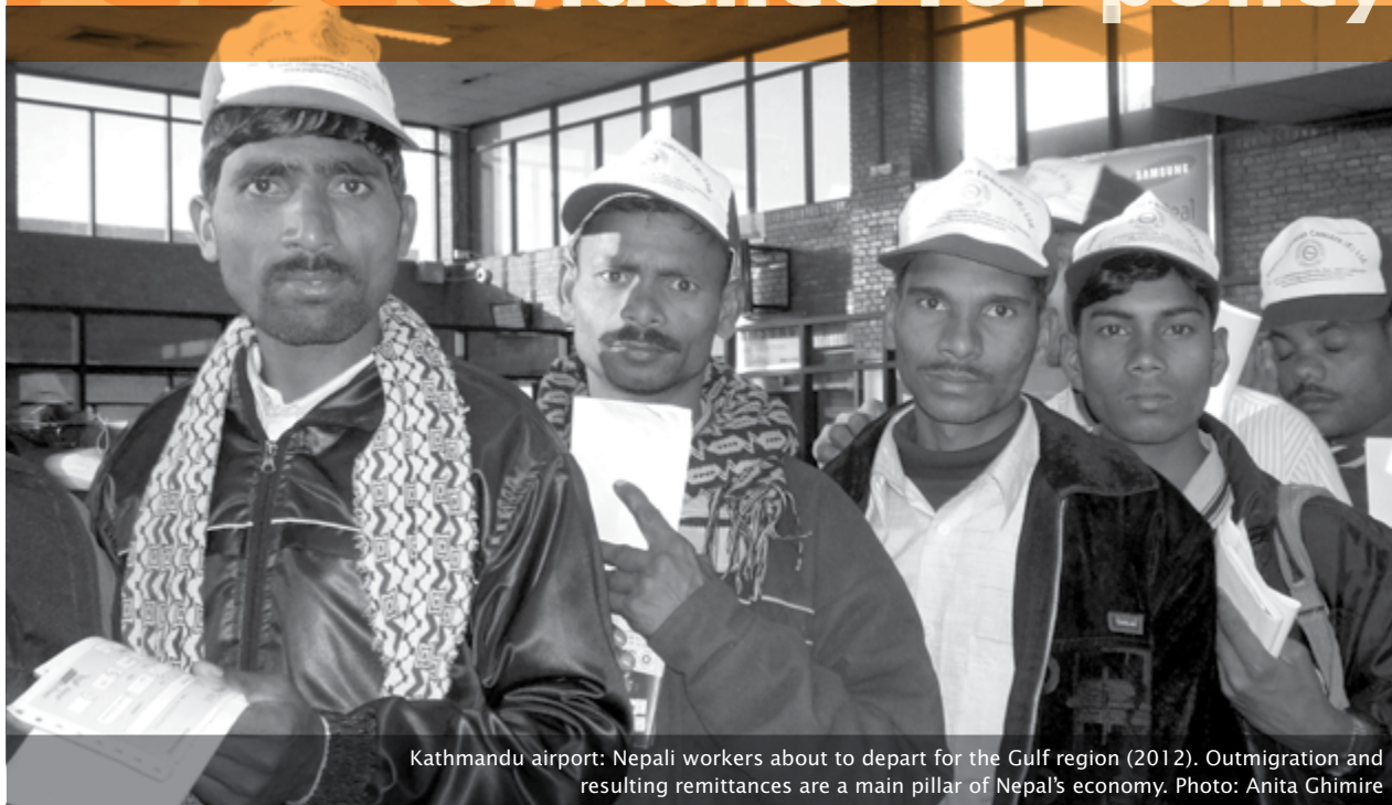
Kathmandu airport: Nepali workers about to depart for the Gulf region (2012). Outmigration and resulting remittances are a main pillar of Nepal's economy.