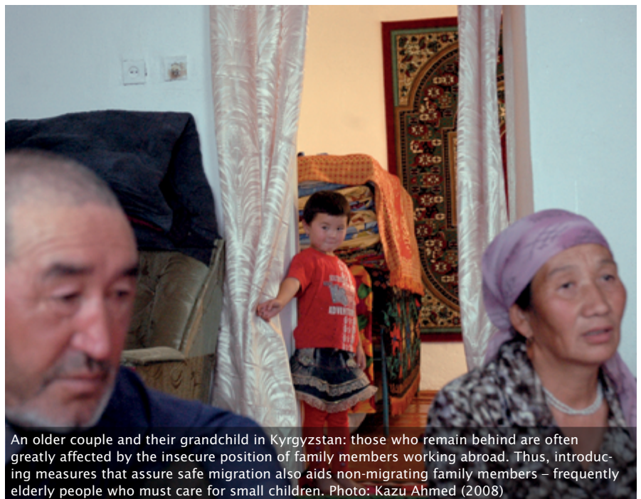
An older couple and their grandchild in Kyrgyzstan: those who remain behind are often greatly affected by the insecure position of family members working abroad. Thus, introducing measures that assure safe migration also aids non-migrating family members – frequently elderly people who must care for small children.

South Asia is not just a region that sends migrants elsewhere. It is also an important receiving and transit region. For example, though known globally as a migrant-sending country, Nepal itself hosts many Bangladeshi