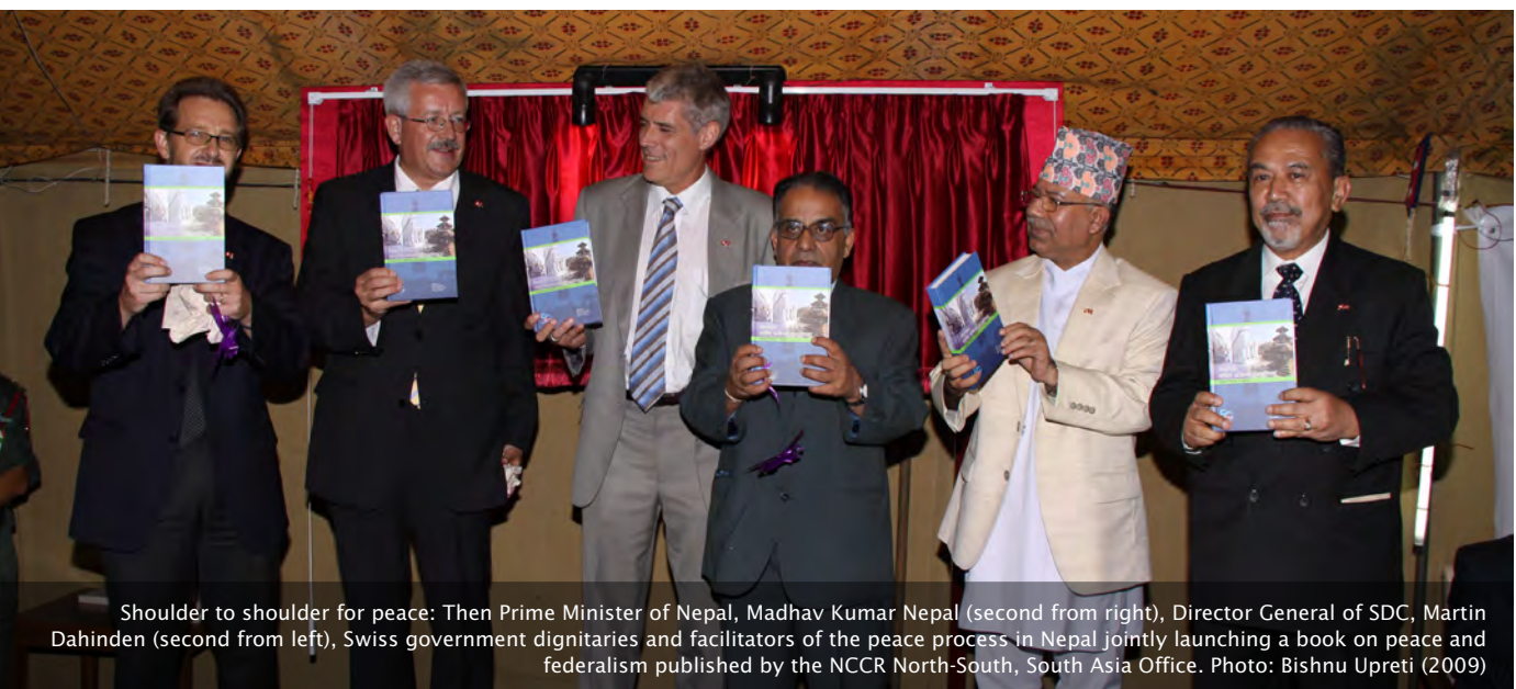
Shoulder to shoulder for peace: Then Prime Minister of Nepal, Madhav Kumar Nepal (second from right), Director General of SDC, Martin Dahinden (second from left), Swiss government dignitaries and facilitators of the peace process in Nepal jointly launching a book on peace and federalism published by the NCCR North-South, South Asia Office.

War economy is a system of production, mobilisation, and allocation of national resources to sustain (or win) a war.