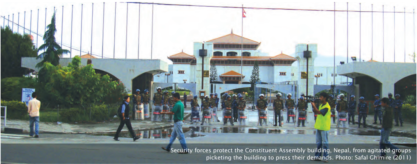
Security forces protect the Constituent Assembly building, Nepal, from agitated groups picketing the building to press their demands.