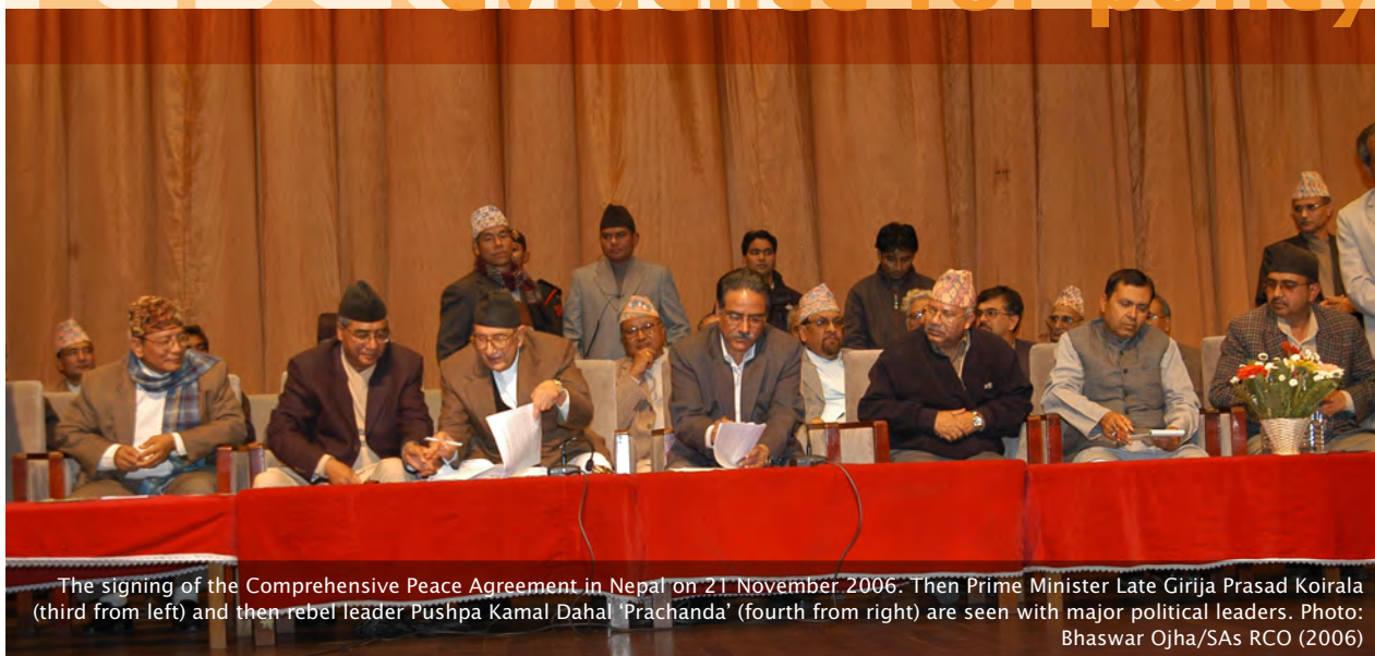
The signing of the Comprehensive Peace Agreement in Nepal on 21 November 2006. Then Prime Minister Late Girija Prasad Koirala (third from left) and then rebel leader Pushpa Kamal Dahal 'Prachanda' (fourth from right) are seen with major political leaders.